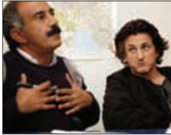
American actor Sean Penn visits an IWPR training session in Baghdad

IF YOU ARE USING THIS BOOK, it is a pretty certain bet that you are already a journalist or you have an interest in the profession.